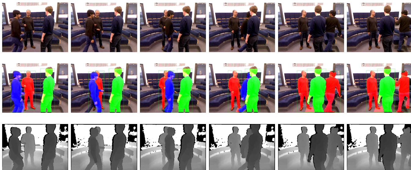
Figure 3: Activity Sequence: passing in-between people , corresponding RGB and Depth profile data