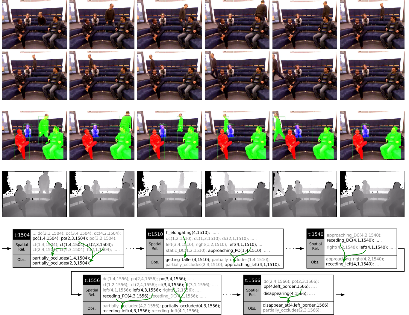
Figure 2: Activity Sequence: leave meeting , corresponding RGB and Depth data, and high-level declarative models